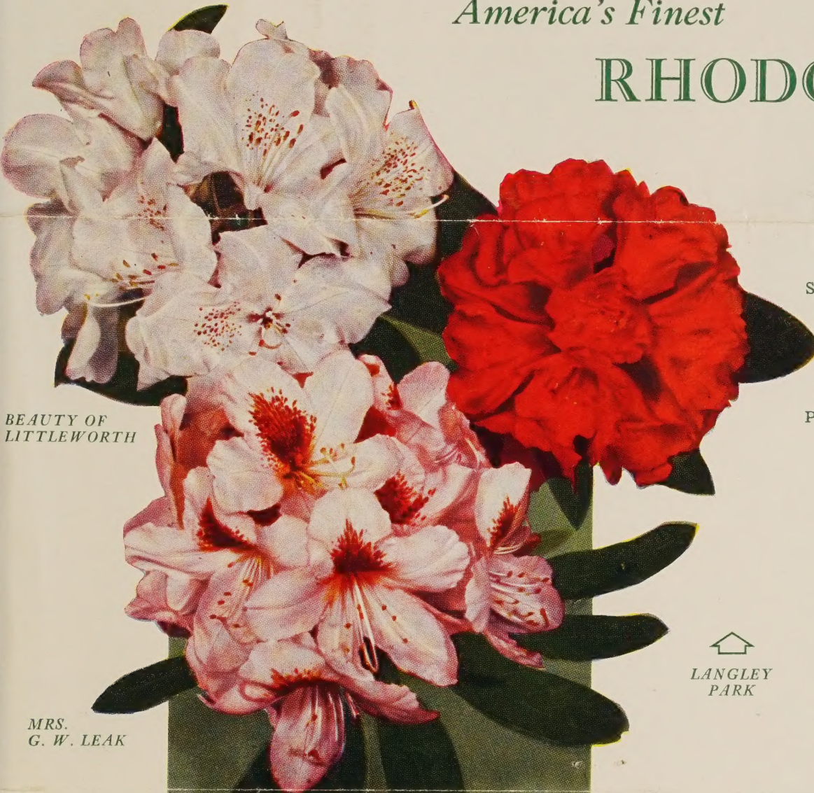
BEAUTY OF LITTLEWORTH

Dig a hole several inches in excess of the ball's depth and width, fill in around the ball with equal parts of peat and loam, tamp with a shovel handle to prevent undue settling and water thoroughly. In a heavy clay, we advise that the soil be removed to at least twice the diameter of the ball's width and replaced with a silty loam. Planting may be carried out between the months of September and April, but we strongly recommend that this operation be performed in the fall so that the plant has a chance to become established before the summer months.